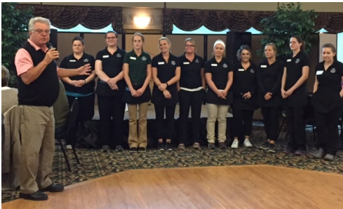
Excellent new Summer Staff on Board!